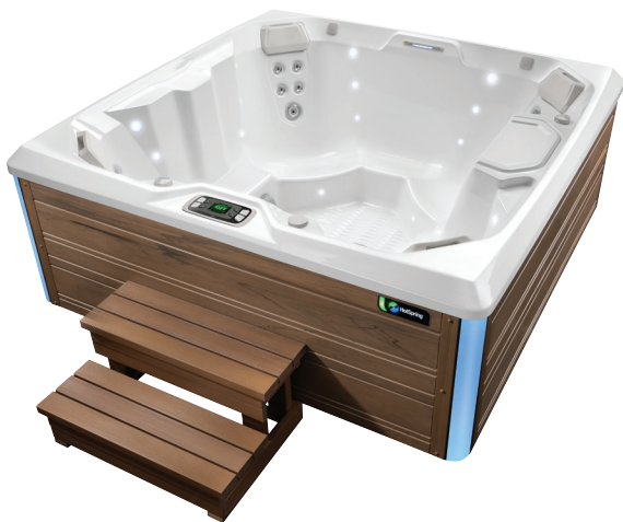
Beam shown with Alpine White shell and Sable cabinet